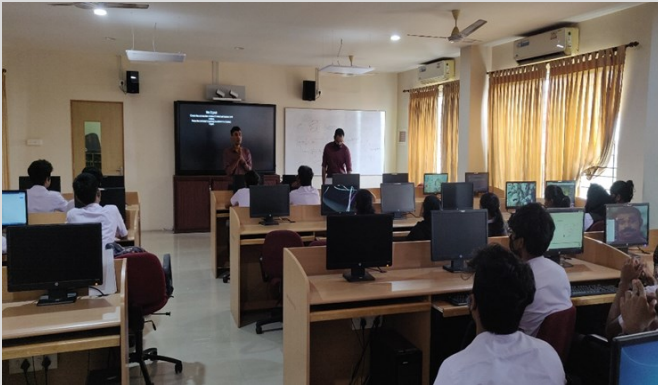
Workshop on “Cisco Networking Fundamentals”